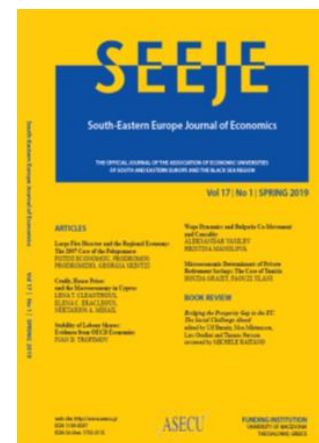
South-Eastern Europe Journal of Economics

All submissions are subject to a high-quality refereeing process.