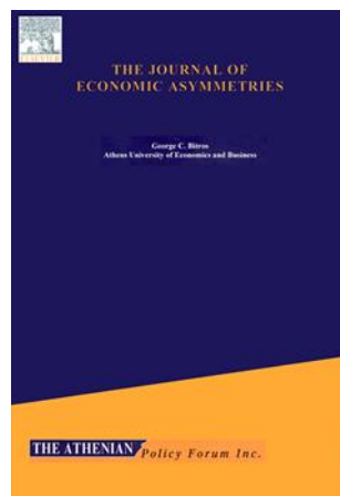
The Journal of Economic Asymmetries