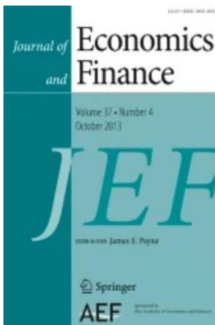
Journal of Economics and Finance

Following the completion of the AMEF 2024 conference, we would like to ask all participants to consider the following options for their papers: